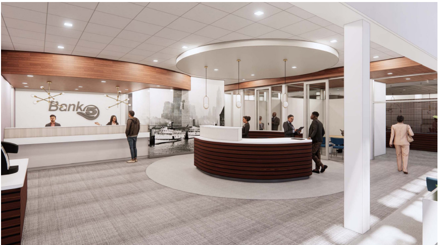
Rendering of new Branch Lobby