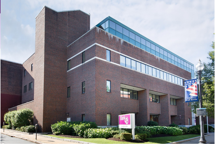
Corporate Office Before Construction