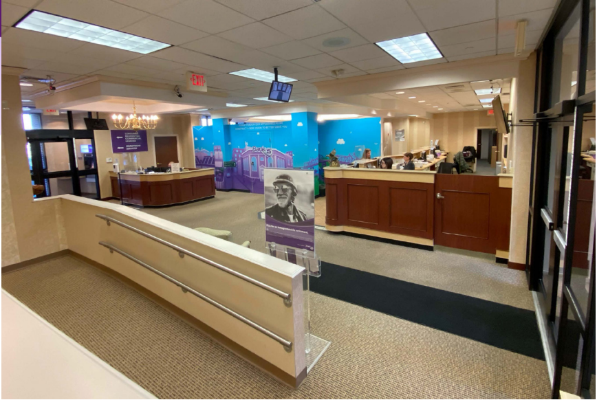
Former view from the Branch Lobby by the rear entrance