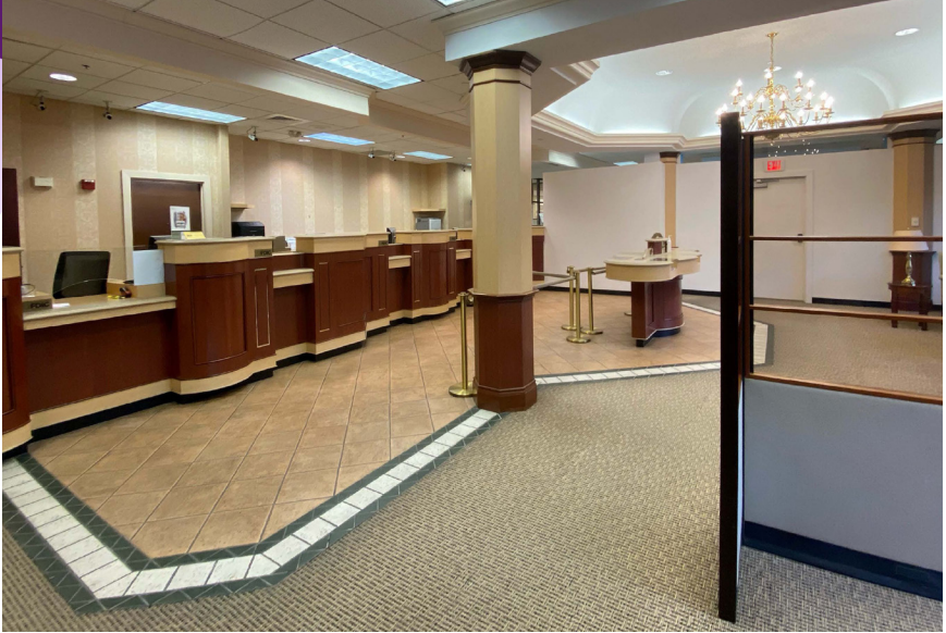
Former Branch Lobby