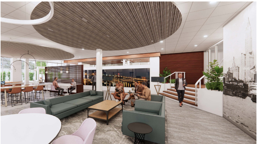
Rendering of the new Living Room and Work Café