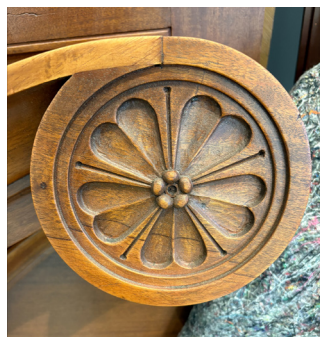
The doors in the Presidents' Room