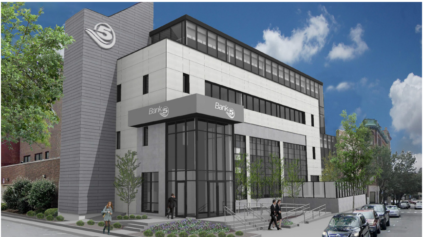
Rendering of Exterior Renovation